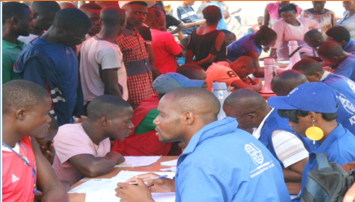
Registration of Migrants at the Transit site of Maluku