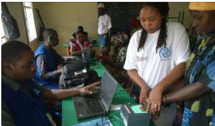
An IDP being registered in Bweremana IDP site DR Congo

Once IOM's expert in charge of biometric registration operations designed, customized and consolidated the database with the biometric registration system, a team composed of twelve Data Collection/Entry Clerks, two Data Entry Assistants, one Senior Information Management Assistant as well as some BENENFANCE staffs, IOM's partner for data collection, were trained.