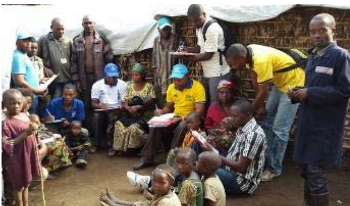
IOM and UNHCR's teams performing the DTM/IDP profiling exercise in Masisi Centre, Democratic Republic of Congo

IOM and UNHCR, as CCCM lead agencies in the North Kivu Province, benefit from a significant experience, acquired in different contexts, should it be natural disasters or conflicts situations. In particular, IOM has implemented the DTM in various countries such as Haiti, Pakistan, the Philippines and more recently in Central African Republic.