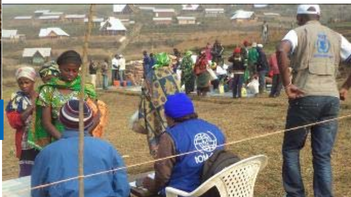
Targeted food distribution in Katalé IDP site, DR Congo

IOM teams as well as site management partners AIDES and CAAP took part in the awareness sessions organized in all sites to ensure safe and smooth first distributions.