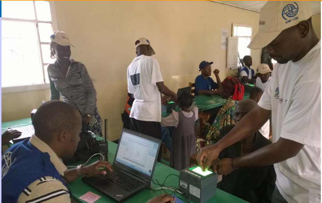
Biometric Registration in Shasha displacement site, Masisi, DR Congo